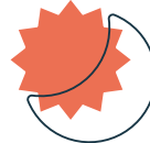
INSOMNIA & SLEEPLESSNESS