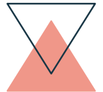
VAGINAL DRYNESS & PAINFUL SEX