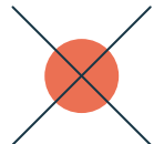
JOINT PAIN & INFLAMMATION