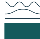
HAIR & SKIN CHANGES